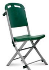
Resistance Chair® Exercise Chair

The Resistance Chair® exercise chair system comes fully equipped with the following items, plus owner's manual, DVD, & wall chart: