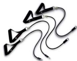
Set of Four (Level 5) Resistance Anchor Cables™

Yes! I would like to order my Resistance Chair® exercise system and take the first step toward a healthier, more active life. I will choose one of the following three ways to order: