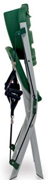
Folds and stands up for easy storage