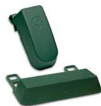
PostureProp™ & Health Step™