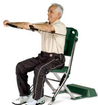
Shoulder and Chest Press